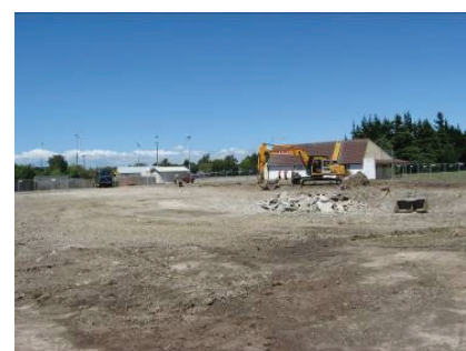
End of Demolition